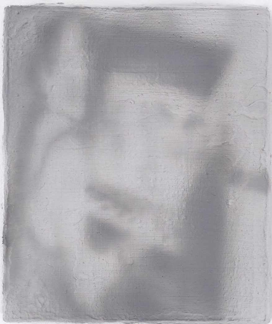
The Lesson , 2025 Gesso and acrylic ink on canvas 30 x 25 x 5 cm