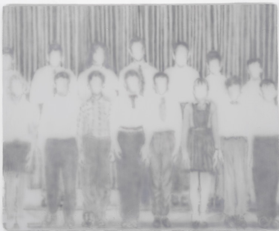
The End , 2025 Gesso and acrylic ink on cotton canvas 130 x 160 x 5 cm