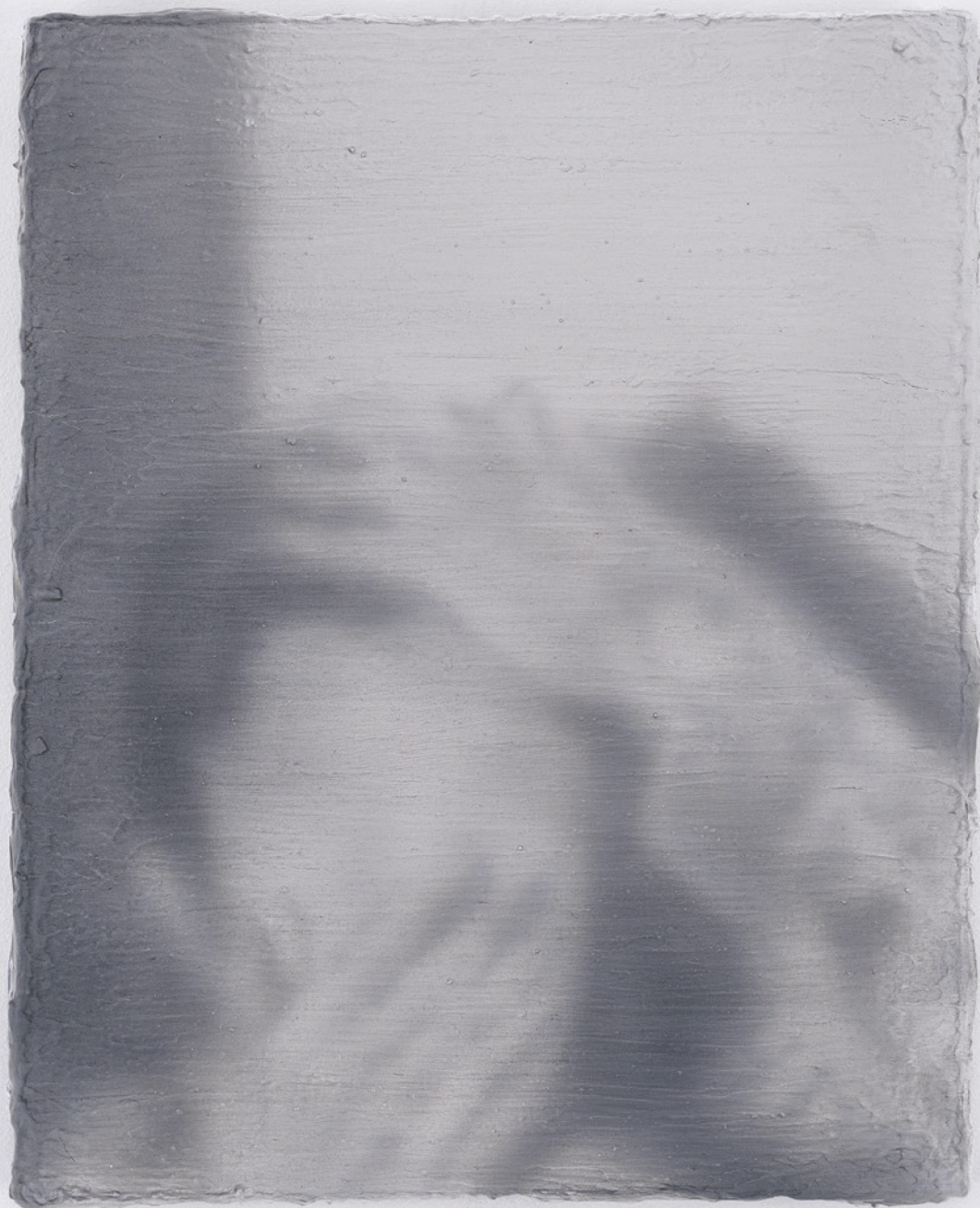
Cleanse , 2025 Gesso and acrylic ink on cotton canvas 50 x 40 x 5 cm