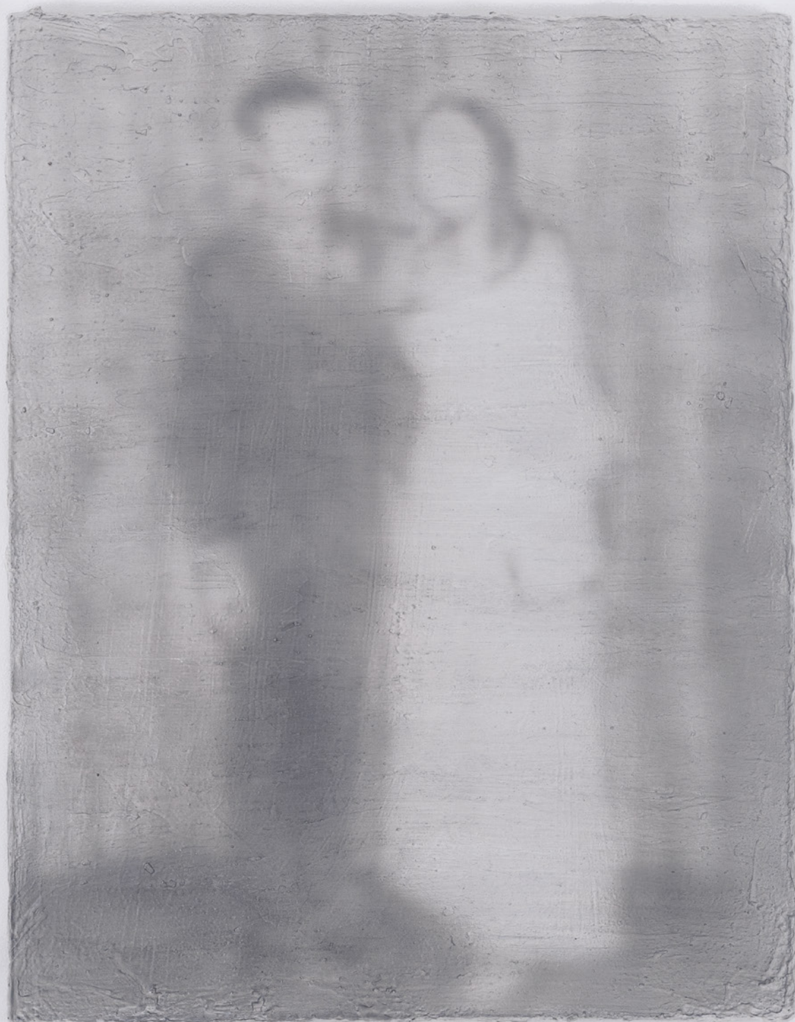
The Dance , 2025 Gesso and acrylic ink on cotton canvas 90 x 70 x 5 cm